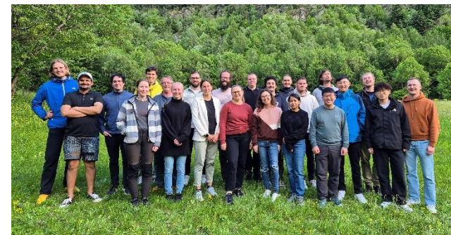
Participants during the EJSW 2024 edition in Saint Maurice.

The 28 th EJSW will not only offer junior scientists an opportunity to present their research work and to be trained in chairing sessions as usual EJSWs, but will also put forward a unique set of practice sessions lead by the Organising Committee.