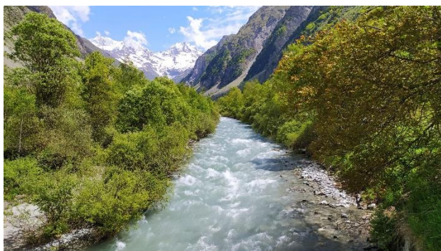
The Séveraise river.

In a plebiscite manner the 6 th edition of this particular workshop offers juniors to i) present and discuss , and ii) hands-on practice of various measuring principles in a setting that gives more opportunity to learn and to share compared to regular conferences.